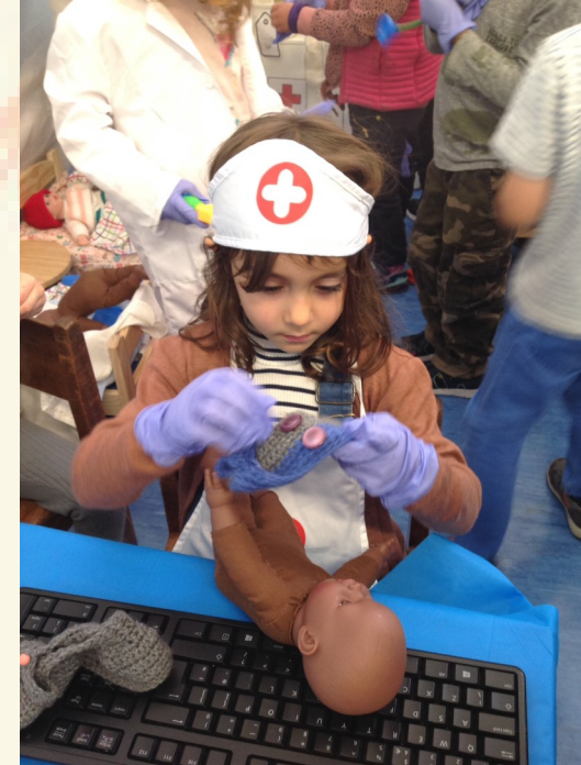
Happy, healthy me!