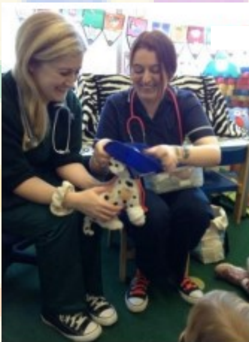
Looking after myself and others.