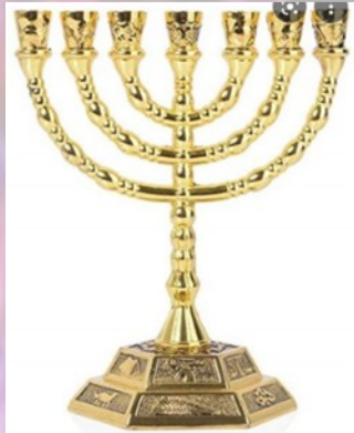
Learning about and celebrating Hanukah