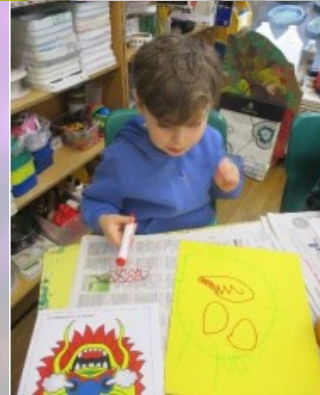
Lunar New Year Celebrations!